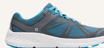
Vitality II Blue/Grey: 24759