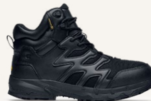
Carrig Mid: 62202